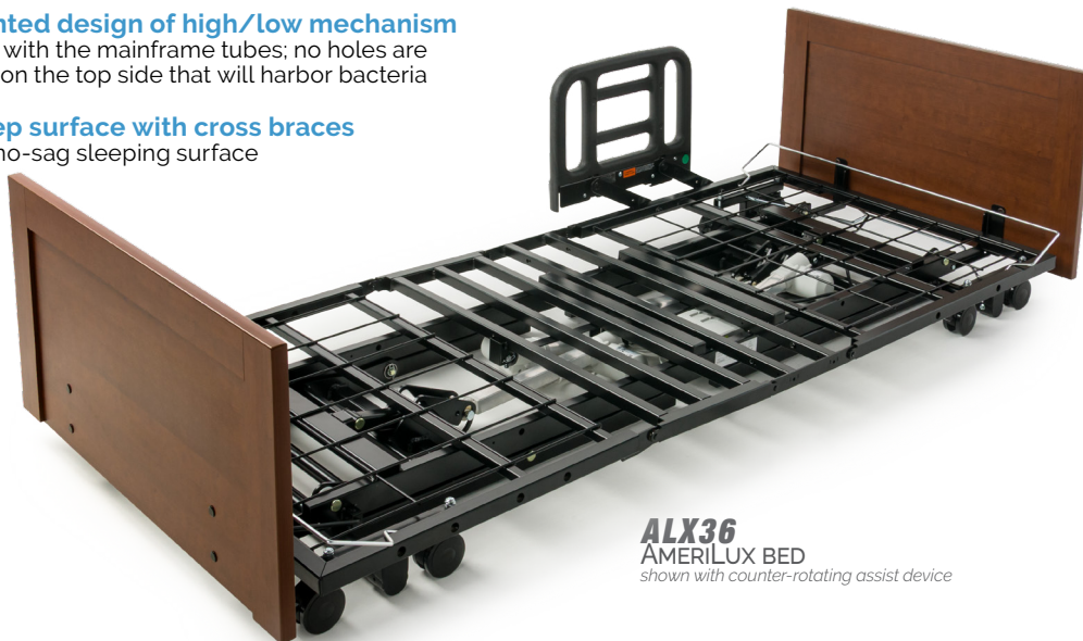
ALX36 AMERILUX BED shown with counter-rotating assist device