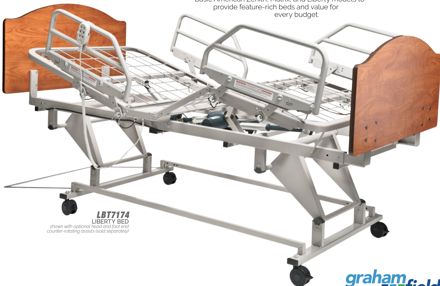
LBT7174 LIBERTY BED

Innovation with industry-leading technology is designed into the Basic American Zenith, Matrix, and Liberty models to provide feature-rich beds and value for every budget.