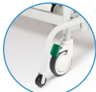
EPOXY COATED STEEL FRAME