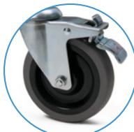
5 INCH CASTERS