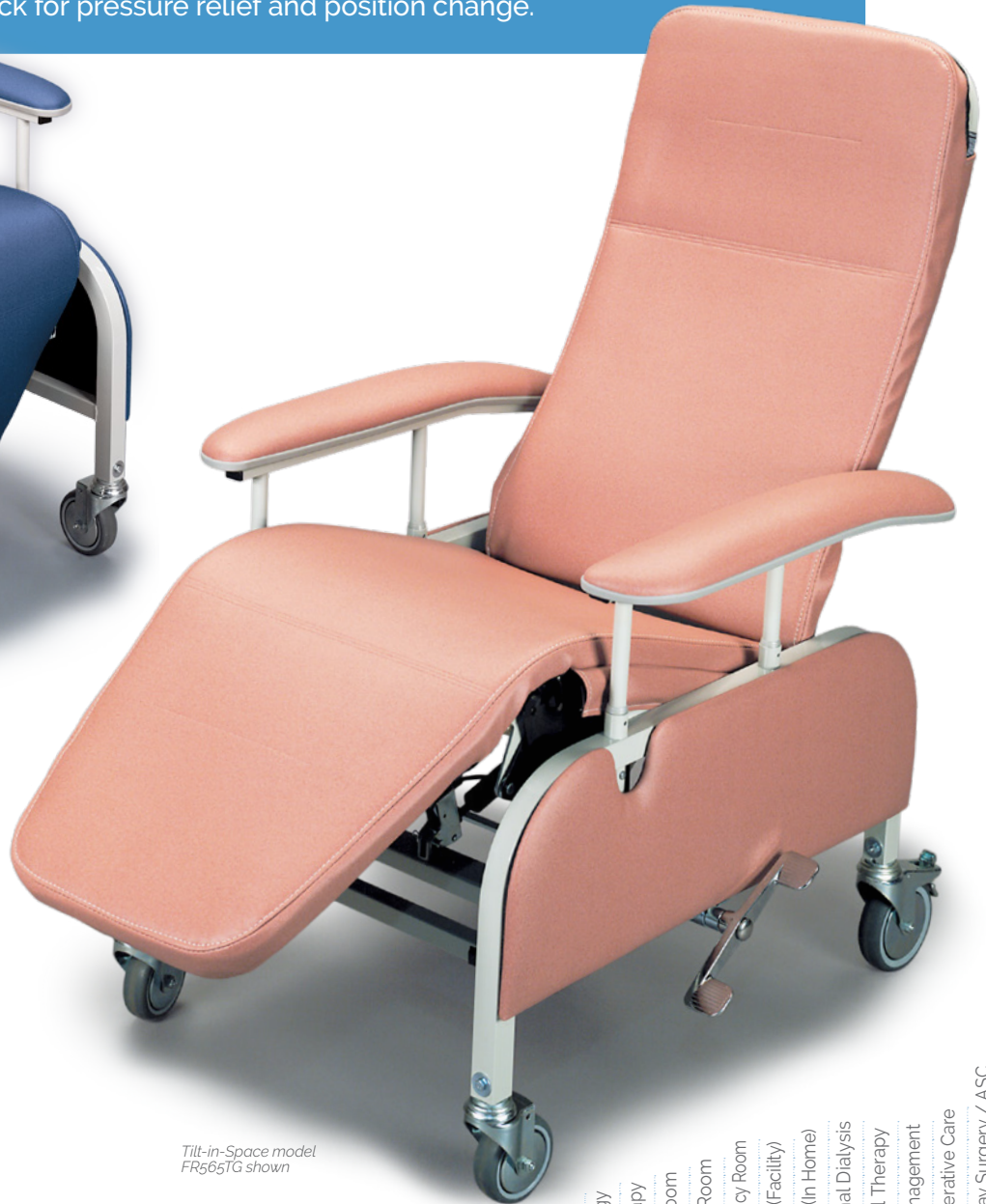
Tilt-in-Space model FR565TG shown