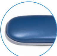
SOFT, WIDE ARMREST