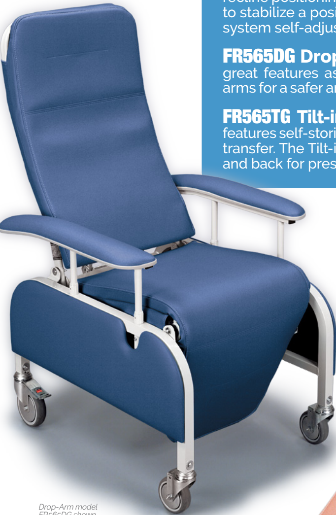
Drop-Arm model FR565DG shown

FR565TG Tilt-in-Space Drop-Arm Preferred Care Recliner features self-storing, height-adjustable drop-arms for safer, easier lateral transfer. The Tilt-in-Space function allows the caregiver to "Tilt" the seat and back for pressure relief and position change.