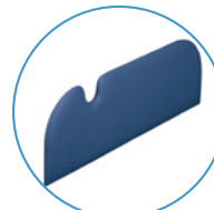
REMOVABLE SIDE PANELS