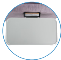
FOLD DOWN, SIDE TABLES