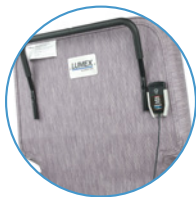
REAR PUSH HANDLE