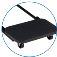
PULLOUT FOOTPLATE 3