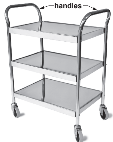
8146 Utility Cart assembled