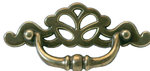
Continental Pull Fixed Bail Polished Brass Finished Pull CP60