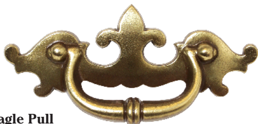
Eagle Pull Fixed Bail Antique Brass Pull EP30