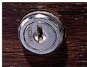
Casegood Lock A29