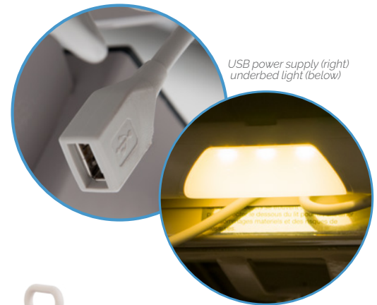
USB power supply (right) underbed light (below)