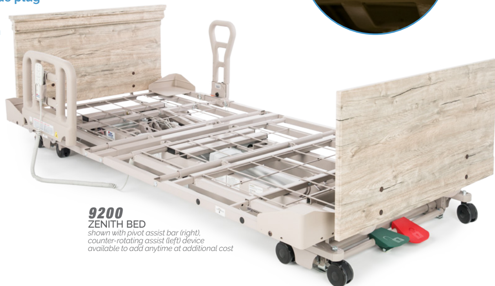
9200 ZENITH BED shown with pivot assist bar (right), counter-rotating assist (left) device available to add anytime at additional cost