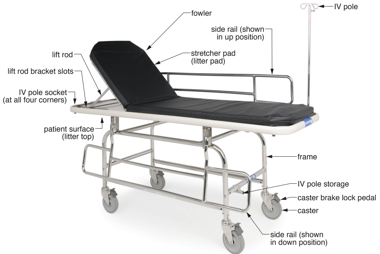
1000MR MRI Transport and Transfer Stretcher