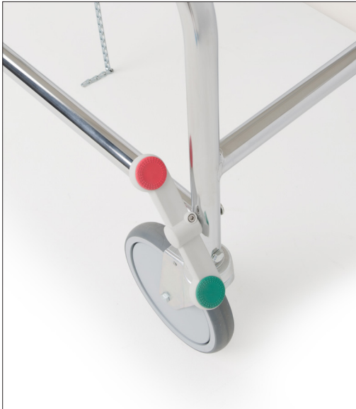
Brake Pedal Shown in STEER Position

The Brake pedals are located at two opposite corners of the stretcher above the casters. Refer to the following illustrations for operation.