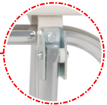
Slide Lock Joint