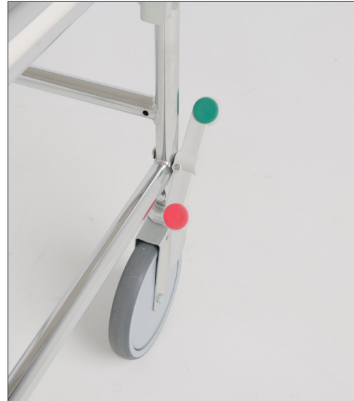
Brake Pedal Shown in BRAKE Position