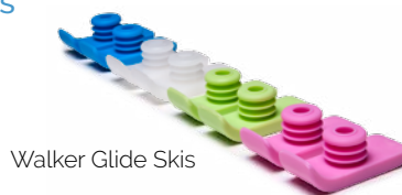
Walker Glide Skis