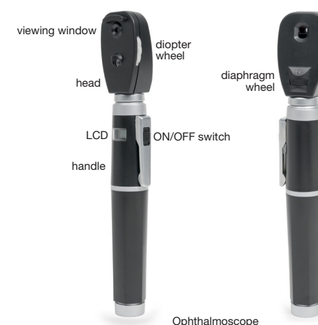
Ophthalmoscope fig. 11

The Ophthalmoscope is shown above in fig. 11 with features labeled.