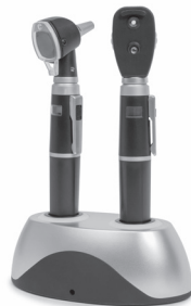
Charger Indicator Light fig. 3

Info: A complete battery charge takes about ten hours. Info: Trickle charging will help prolong battery life. The base can be used for storage, even if charging is not required, without damaging Otoscope and Ophthalmoscope, as long as ON/OFF switches are off.