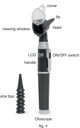
Otoscope fig. 4

The Otoscope is shown above in fig. 4 with features labeled.