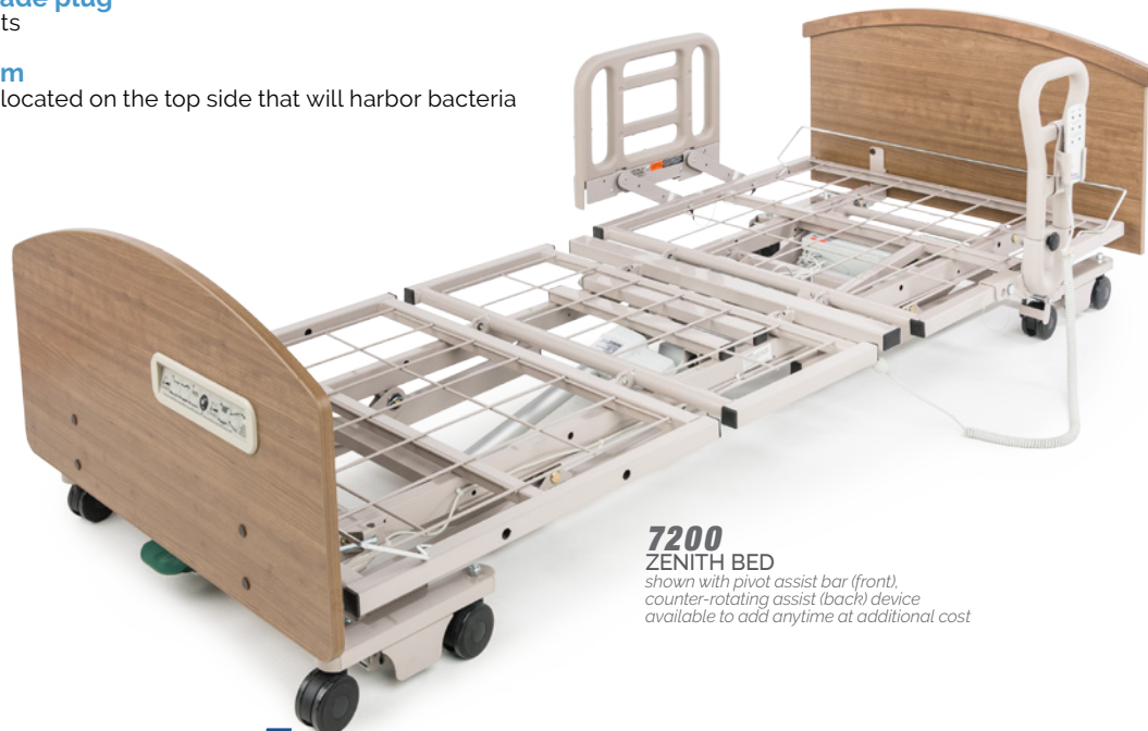
7200 ZENITH BED shown with pivot assist bar (front), counter-rotating assist (back) device available to add anytime at additional cost