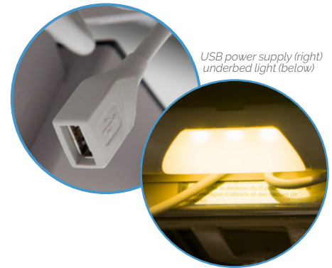
USB power supply (right) underbed light (below)