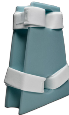
P301 - 14 INCH WIDTH P302 - 16 INCH WIDTH P303 - 18 INCH WIDTH