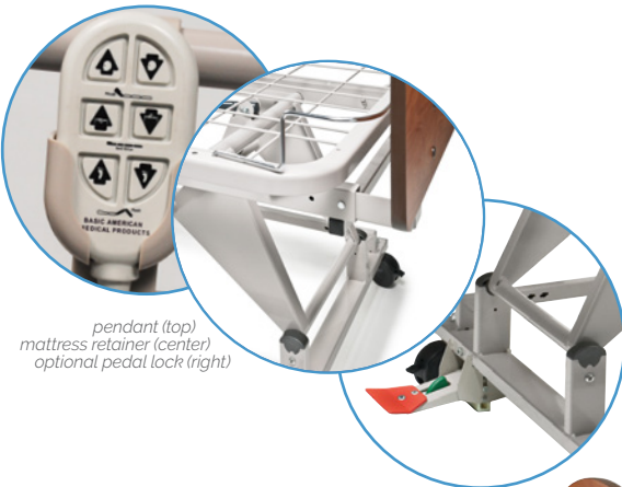
pendant (top) mattress retainer (center) optional pedal lock (right)