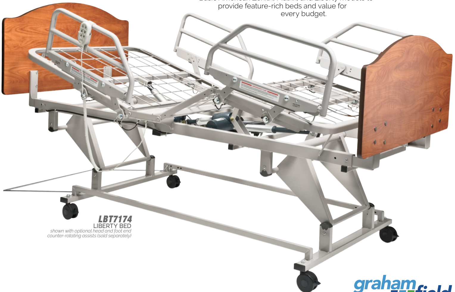
LBT7174 LIBERTY BED shown with optional head and foot end counter-rotating assists (sold separately)

Innovation with industry-leading technology is designed into the Basic American Zenith, Matrix, and Liberty models to provide feature-rich beds and value for every budget.