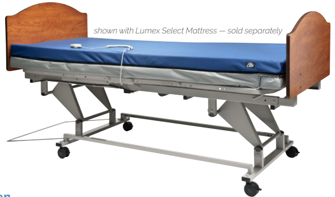
shown with Lumex Select Mattress — sold separately