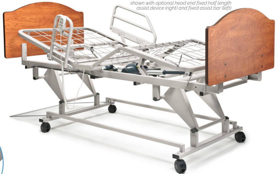
shown with optional head end fixed half length assist device (right) and fixed assist bar (left)