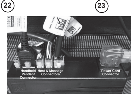
24 Heat and Massage Feature – Control Module and Transformer Unit Showing All Connections Correctly Made