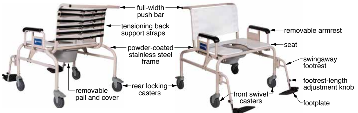
5226 / 5228 Bariatric Shower Commode Chair