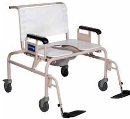
5226 / 5228 Bariatric Shower Commode Chair