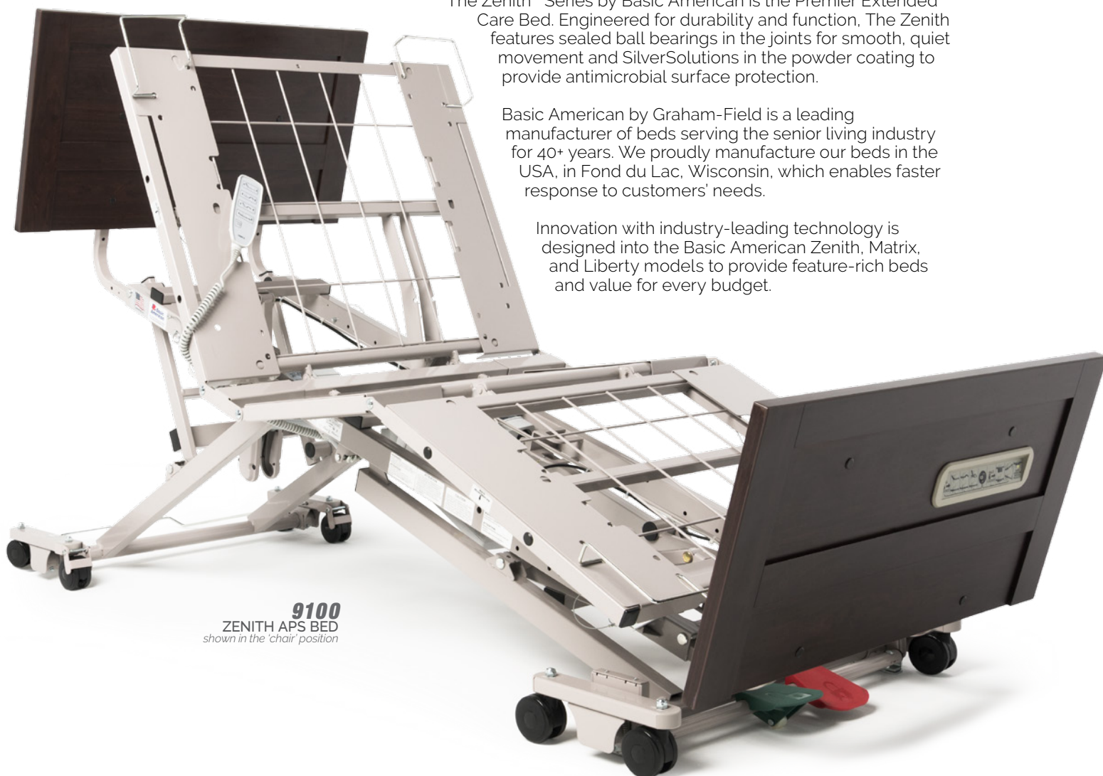
9100 ZENITH APS BED shown in the 'chair' position

The Zenith™ Series by Basic American is the Premier Extended Care Bed. Engineered for durability and function, The Zenith features sealed ball bearings in the joints for smooth, quiet movement and SilverSolutions in the powder coating to provide antimicrobial surface protection.