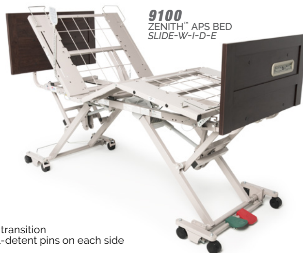
9100 ZENITH™ APS BED SLIDE-W-I-D-E