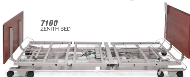
7100 ZENITH BED