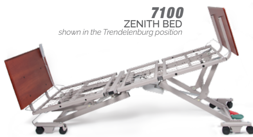
7100 ZENITH BED shown in the Trendelenburg position