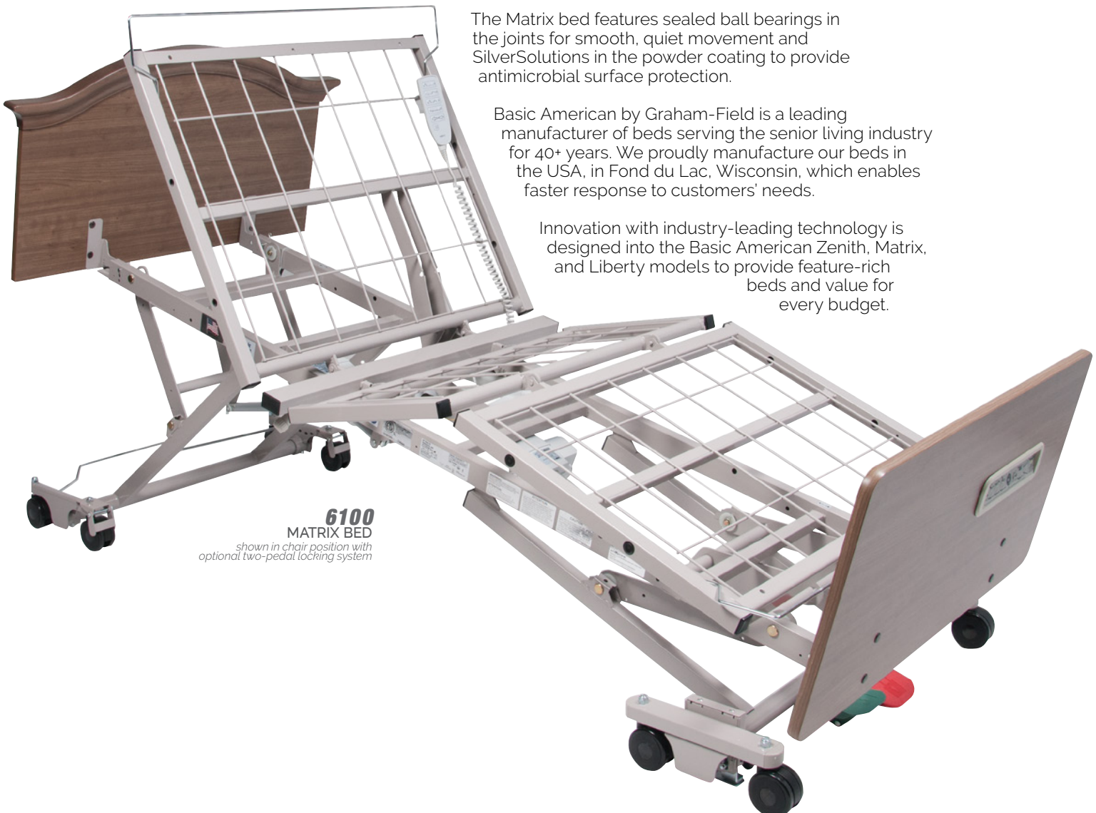
6100 MATRIX BED shown in chair position with optional two-pedal locking system

Innovation with industry-leading technology is designed into the Basic American Zenith, Matrix, and Liberty models to provide feature-rich beds and value for every budget.