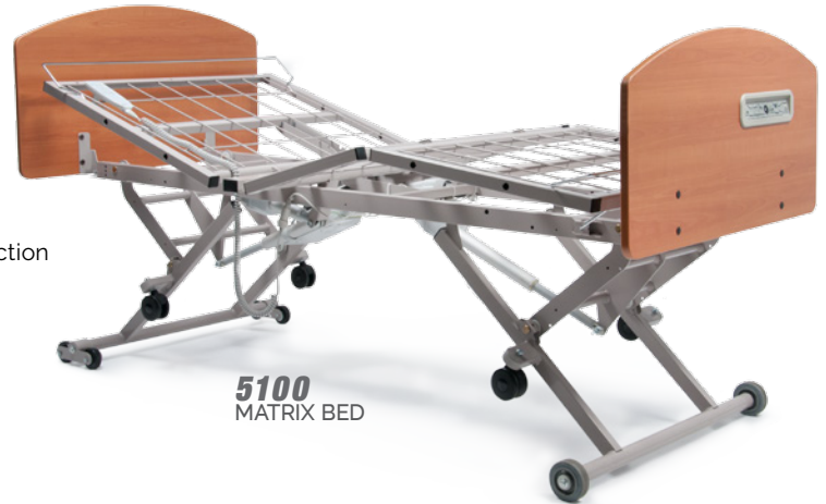
5100 MATRIX BED