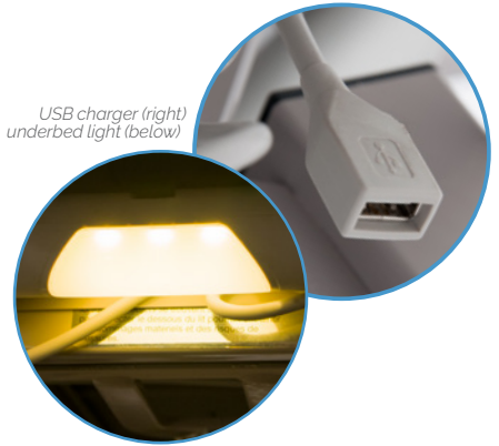
USB charger (right) underbed light (below)