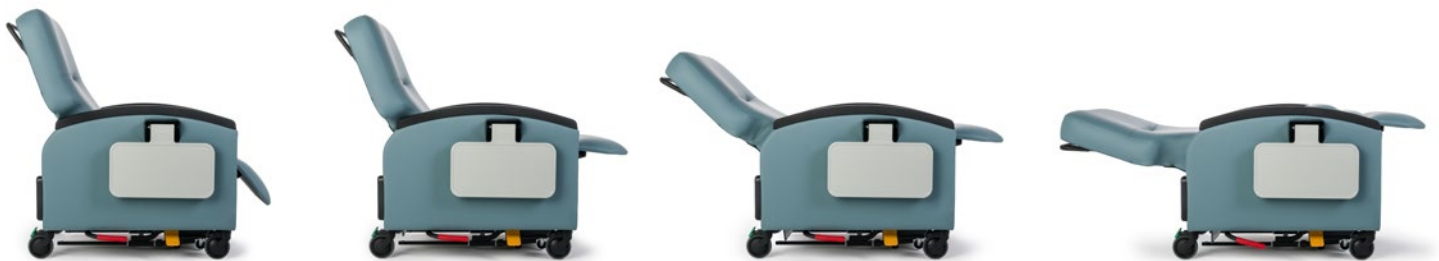
Multiple Positions for Enhanced Patient Comfort