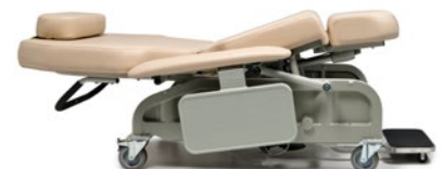
Multiple Positions for Enhanced Patient Comfort