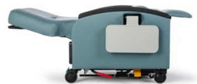
Multiple Positions for Enhanced Patient Comfort