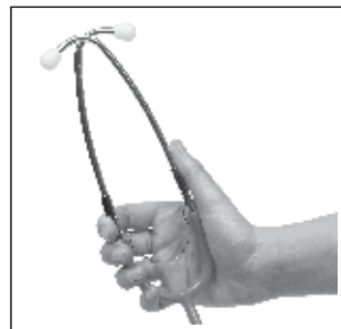
Increase binaural tension (tighten)

To loosen the binaural , grasp it with both hands above the "Y", as shown at lower right. Pull binaural apart gently until the desired tension is achieved.