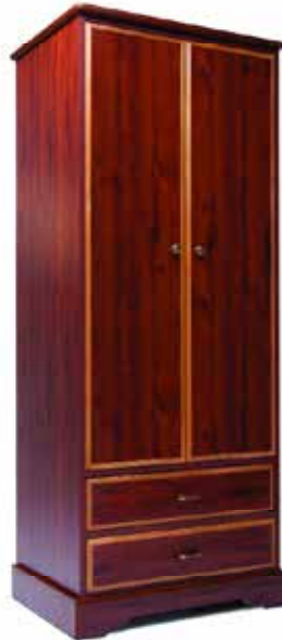
Two Door, Two Drawer Wardrobe B021-52