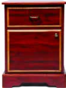
Door/Drawer Bedside Cabinet A36-52