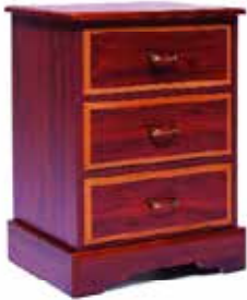
Three Drawer Bedside Chest A31-52