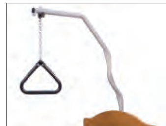
ZA79000 (for use with ZA78100 Trapeze Bar)

Optional trapeze adapter allows for easy attachment of trapeze system to headboard within easy reach for residents for repositioning themselves.