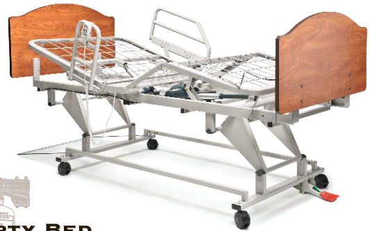
The LIBERTY BED

Height travel range: 8.95" to 27" 76"/80"L x 35"W Advanced Positioning: Chair Trendelenburg/Reverse Trendelenburg (with Embedded Staff) Safe Work Load: 450 lbs. Intuitive pedal lock