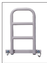
ZA80300 Fixed Assist