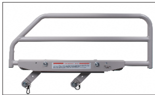
ZA78400 and ZA82800 Counter-rotating Assist Device