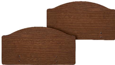
Center Crown laminate panel with T-Mold Edge