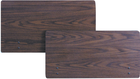
Rectangular laminate panel with T-Mold Edge

Get these fine quality beds and accessories shipped* within 3 business days!