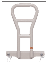
ZA85000 Fixed Assist