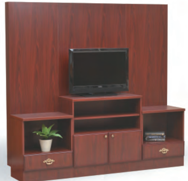
Flexibility allows modular components to be used in many areas within a facility.