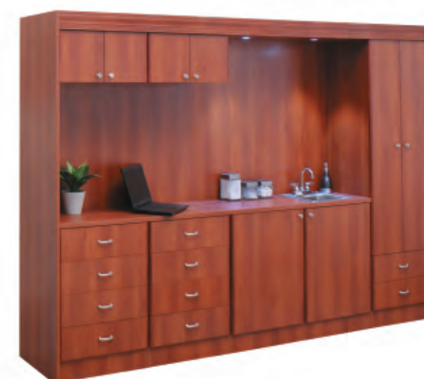
Avante Collection Nursing Station