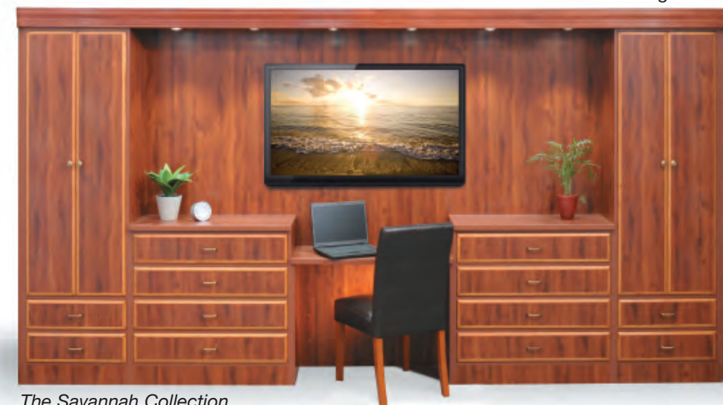
The Savannah Collection Double resident room configuration

C3 components provide further customizing and flexibility with back panels. All back panels provide a 4" utility chase for electrical, networking, and plumbing. Enhance room ambience by adding canopies with lighting, shelving, and modular storage. C3's slim design, 2.5" in depth, allows more open area for caregiver and resident by utilizing a smaller room foot print, while still meeting needs.