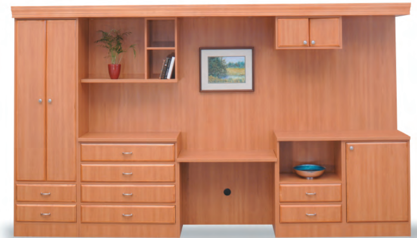
The Oak Park Collection