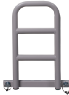
Fixed Assist Bar for Head End, ea. ZA80300