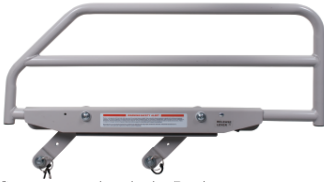
Counter-rotating Assist Device for Head End, pr. ZA78400