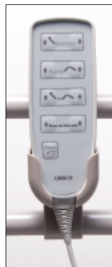
Matrix4000APS hand pendant (Optional hand pendant with Trendelenburg/Reverse Trendelenburg is available).