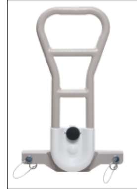
Pivoting Assist Bar for Head End, ea. ZA90350