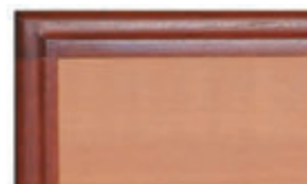
Fonthill Pear with Wine