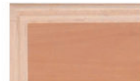
Fonthill Pear with Cream