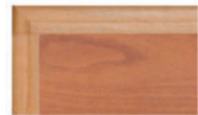
Wild Cherry with Honey