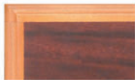
Figured Mahogany with Amber