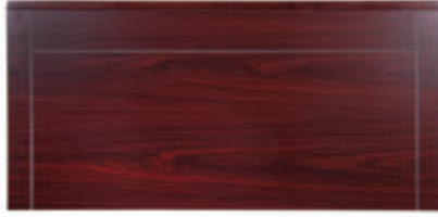
Bull Nose Edge Laminate panel with top, side, and center raised panels, 2mm edges radius side edges F17R36 36" x 18" F17R39 39" x 18" F17R42 42" x 18"