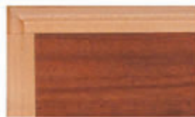
Windsor Mahogany with Champagne Windsor