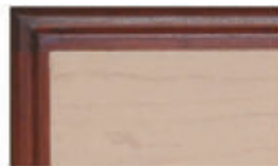
Maple with Burgundy