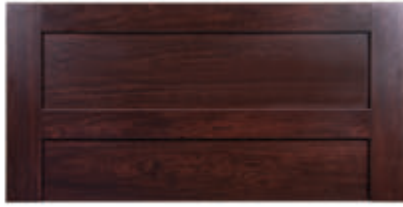
Raised Panel Laminate panel with raised panels along top, sides, and center, 3mm radius edges F10R36 36" x 18" F10R39 39" x 18" F10R42 42" x 18"