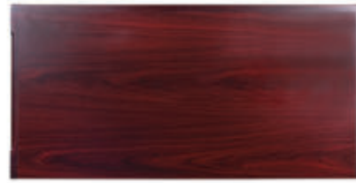
Bull Nose Edge with Vertical Cover Moldings Ogee profiled solid wood pediment with vertical corner cover moldings on laminate panel F18R36 36" x 18" F18R39 39" x 18" F18R42 42" x 18"