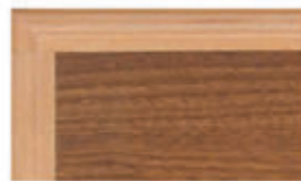
Montana Walnut with Pecan