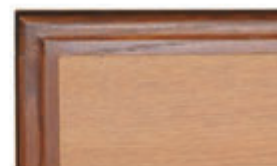
Solar Oak with Mocha