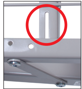
Patent Pending Rail Slots