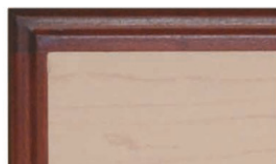
Maple with Burgundy