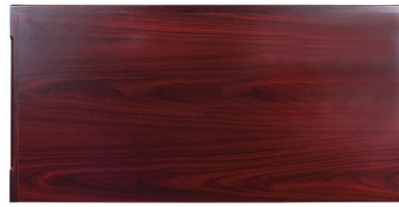
Bull Nose Edge with Vertical Cover Moldings Ogee profiled solid wood pediment with vertical corner cover moldings on laminate panel F18R36 36" x 18" F18R39 39" x 18" F18R42 42" x 18"