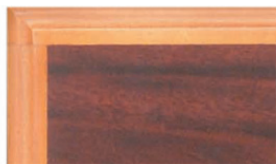
Figured Mahogany with Amber