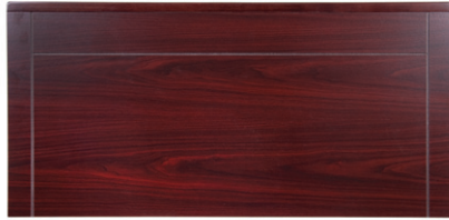
Bull Nose Edge Laminate panel with top, side, and center raised panels, 2mm edges radius side edges F17R36 36" x 18" F17R39 39" x 18" F17R42 42" x 18"