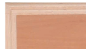
Fonthill Pear with Cream