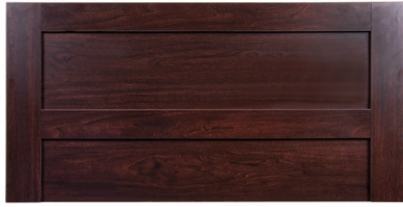
Raised Panel Laminate panel with raised panels along top, sides, and center, 3mm radius edges F10R36 36" x 18" F10R39 39" x 18" F10R42 42" x 18"