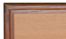
Solar Oak with Mocha