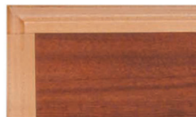
Windsor Mahogany with Champagne Windsor