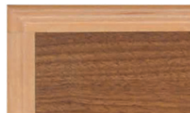
Montana Walnut with Pecan