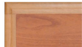
Wild Cherry with Honey