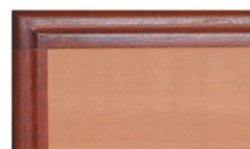
Fonthill Pear with Wine