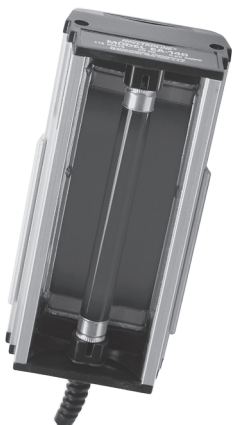
Model 2211 E-Series Hand-Held Ultraviolet Lamp