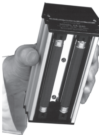
Model 2213 E-Series Hand-Held Ultraviolet Lamp