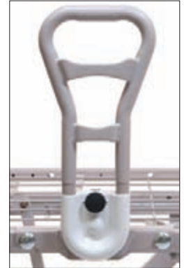
Pivoting Assist Bar ZA85500