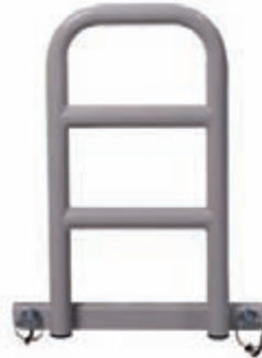
Fixed Assist Bar for Head End of 76" or 80" Bed ZA80300