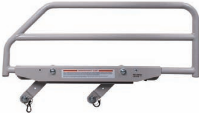
Half Length Assist Device for Head End 76" or 80", pr. ZA78400

Half length assist devices and assist bars provide a sturdy handhold to assist residents in and out of bed. Assist devices are removable without tools and meet FDA Entrapment Guidelines providing utmost security for residents.