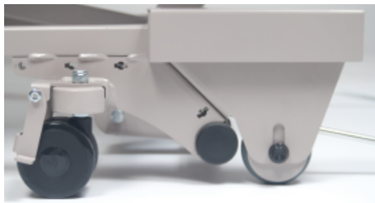
Head section unlocked and locked