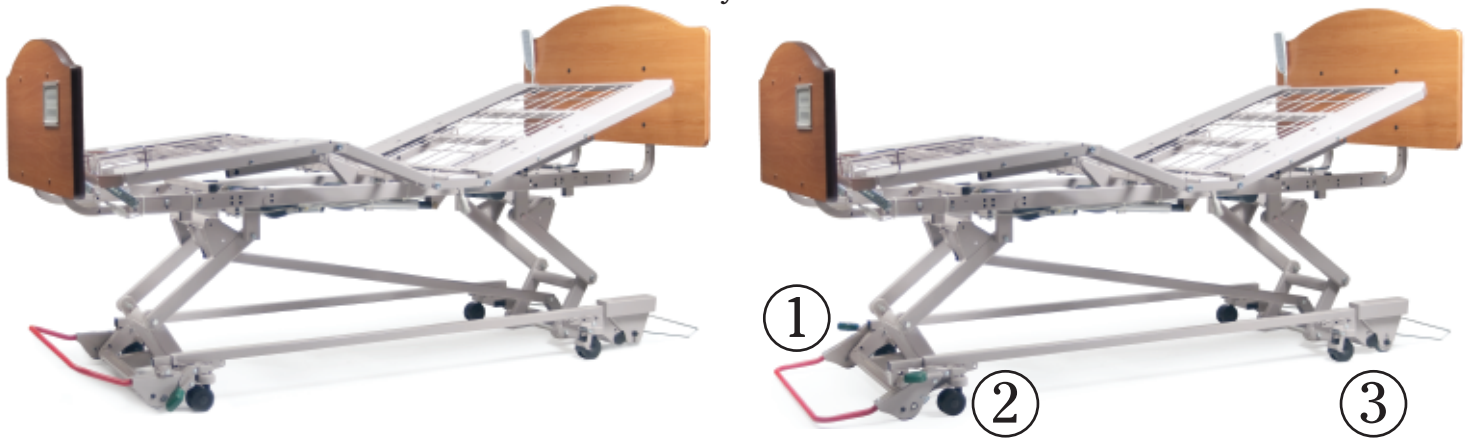
Shown unlocked and locked

Saves time and adds security so that the bed won't move.