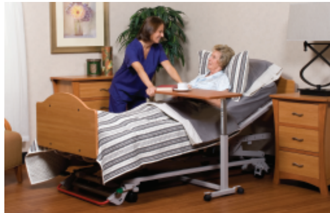
Basic American Medical Products offers these and more Complimentary Products to meet your facility need.