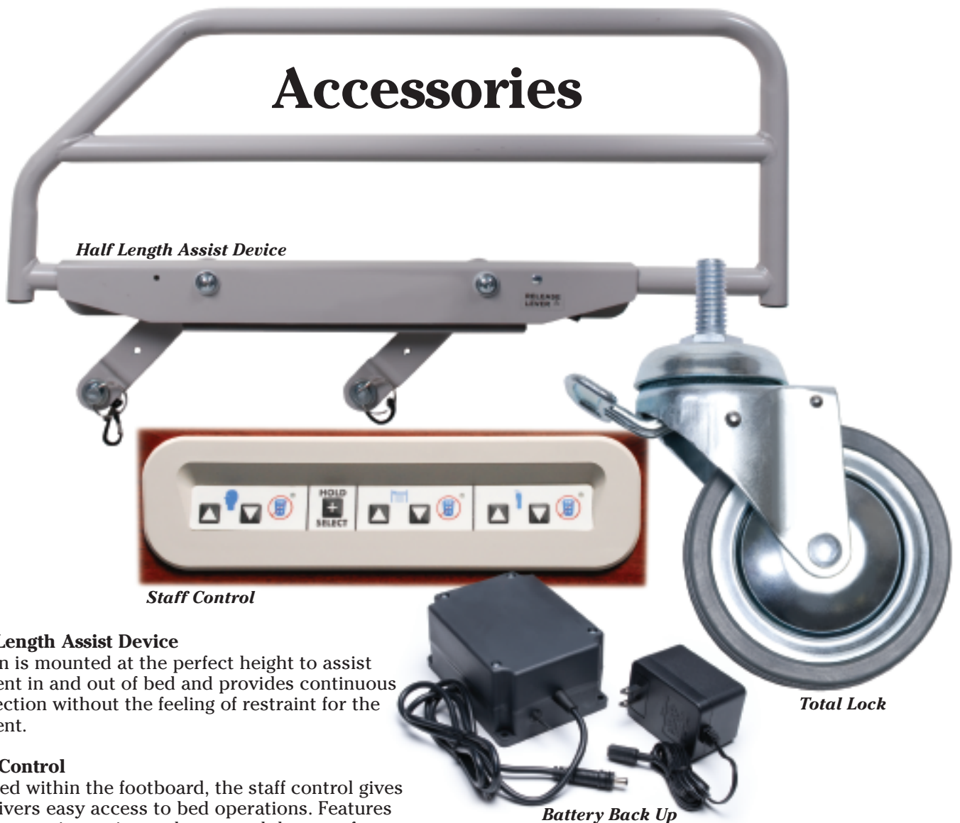
Half Length Assist Device